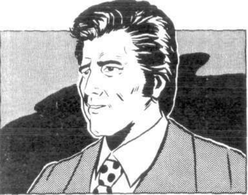
NOW, HE IS PROUD AND EXTREMELY SPOILED AND SELFSH, BUT I WOULDN'T CONSIDER HE IS SELF-RIGHTEOUS! HE DOESN'T CONSIDER HE COULD NEVER MAKE A MISTAKE!