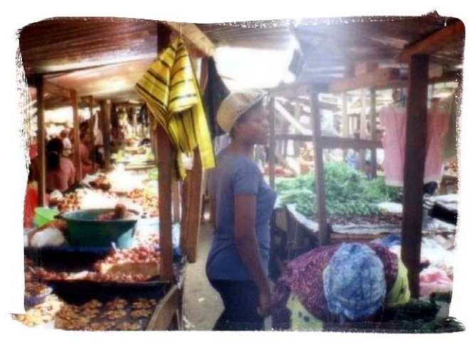
Part of the fruit and vegetable section of the local market.

Firstly, we have "supermarkets," of which there are two in the city. Each is about the size