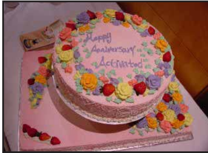
"Happy Anniversary Activated!" reads the provisioned custom-made two-layer cake that fed 150 people!