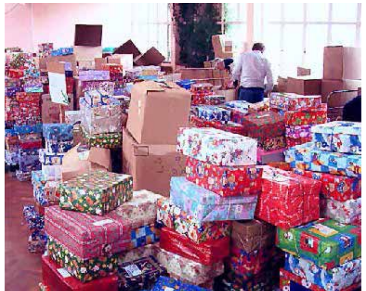
Colorfully wrapped shoe boxes full of surprises for the children