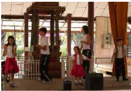
Our kids performing their Christmas show

Once again, through the contribution of one of our sponsors, we were again able to