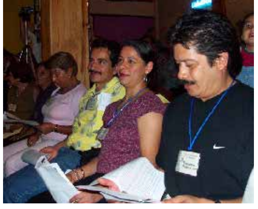
Some of the attendees

We created a color brochure to pass out, advertising the retreat, which turned out really nice. By the middle of July, we had gotten the word out about the retreat and reservations started coming in. By the middle of August there were more registrations than we had space for! Graciously, some of our CM Family gave up their places so that there was enough room for Active members. The Lord had told us that. "If we built it. they would come," and that prophecy was certainly fulfilled.