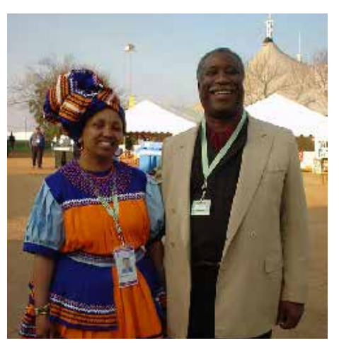
Leyland with woman in African dress