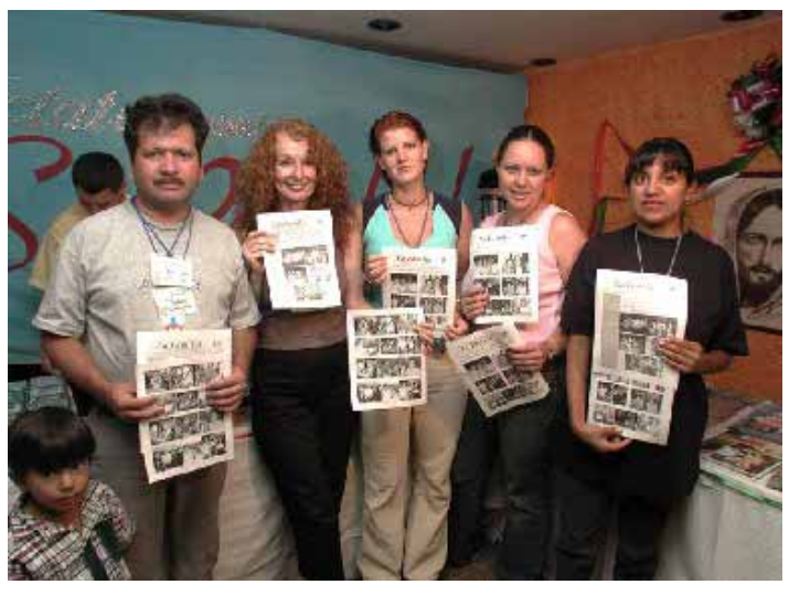
Attendees holding up a daily log of the event