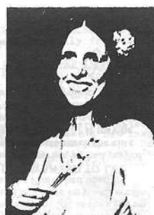
GRACE--"The most beautiful part of you is that lovely radiant happy smiling Spirit-filled face!"

WE REALLY HOPE THAT YOU LIKE THE WAY THAT THE FINAL EDITING WAS DONE & THE INCLUDING OF THE LITTLE INTERLUDES BETWEEN THE NUMBERS WITH THE QUOTES, which I think so faithfully selected from the letters, & we pray that the way