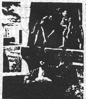
Unconventional Paul escapes the wrath of the System. Acts 9:22-28.

A CLASS FROM ACTS GIVEN IN THE EARLY DAYS OF THE REVOLUTION!