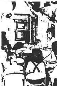
Showing a Kid Power video at "The Happy Children Club".

NOW THAT WE HAVE A VIDEO MACHINE, we have been using it a lot in reinforcing God's Word into the children via such good movies as "Jesus of Nazareth" & "The Bible", showing different parts to correspond with the Bible