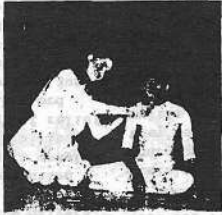
"Love" (left) is loving up "Innocence", & then (below) "Innocence" learns to sow love to others.

OF COURSE NO LETTERS ARE A CONSTANT SOURCE OF SPIRITUAL FOOD & EXCITING TEACHING IDEAS. The flannelgraph