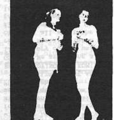
After several encounters between "Evil" & "Love", "Innocence" becomes aware of "Evil's" tricks & deceit & receives "Love's" heart (Jesus). Off-stage (left), the actress gives a look of love--a lovely "bad guy".

THE MOST FRUITFUL THING ABOUT THIS WHOLE THEATRE EXPERIENCE HAS BEEN MY PERSONAL CONTACT & INFLUENCE on my students in a friendlier "out of the classroom" situation. Before most of the rehearsals & every time we have put on the play, we've been holding hands & praying, & the Lord has really been answering our prayers. The girls have learned so many