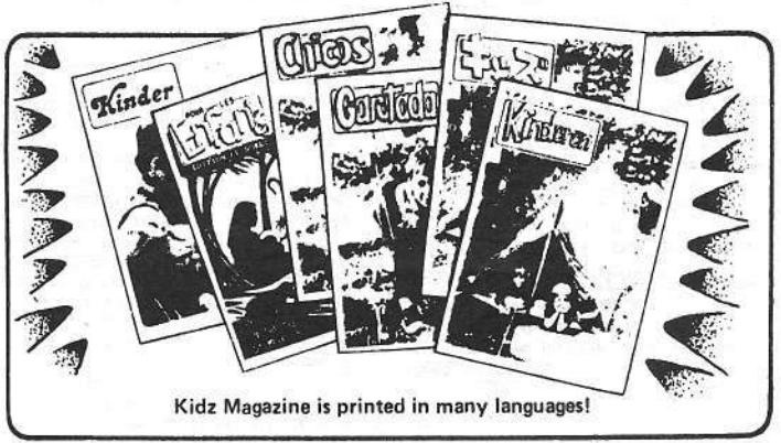
Kidz Magazine is printed in many languages!