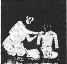
"Love"(left) is loving up "Innocence", & then (below) "Innocence" learns to sow love to others.

OF COURSE NO LETTERS ARE A CONSTANT SOURCE OF SPIRITUAL FOOD & EXCITING TEACHING IDEAS. The flannelgraph