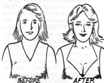
Variations in altering necklines: (Drawing A) Split a V-neck more open, or gather with thread further down, to give more shape and lower the neckline. (Drawing B) Gather

We have found it's very easy to alter the neckline to give more view in front, by gathering closer to the shoulders an open or V-necked blouse or dress. (See drawing below.) Also, dresses that button down the front can be very sexy. It is also easy to alter a dress by making a split up the side or back seam.