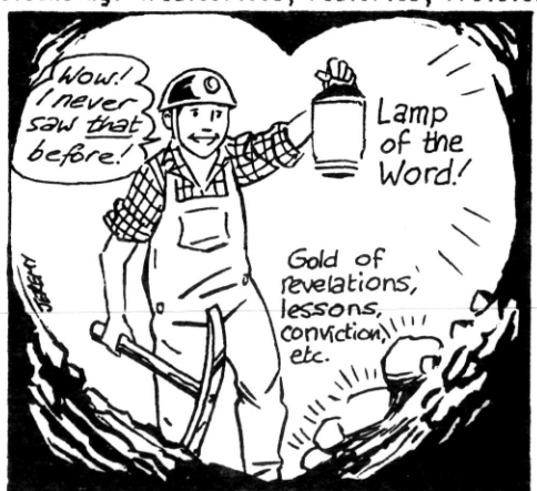
Your Word time can either be a real

That's how you personally apply the Word, you "shine" it like a lamp into the darkest corners of your heart to seek & find what shows up! It's like you hold up the Lamp of the Word, as you enter a cave, the cave of your heart, & you pray with each step that the Lord will lead & quide you, & show you the way. Pray as you read that He enlightens your eyes & the pathway of your heart, & brightens it with truth & light & cleansing! (Psa.119:105; Psa.19:8b; Pro.3:6)