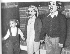
The children's first public witness singing at our neighbour's home, Christmas '80!

23. LET'S GET ON WITH THE EXTREMELY HELPFUL LESSONS DAD HAS TAUGHT US ON