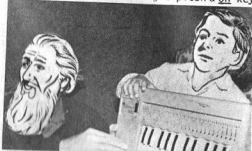
Small, portable "Bontempi"-brand organ, battery operated.

17. SO THERE'S JUST A BIT OF BACKGROUND ON HOW WE'VE EMPHASISED RHYTHM, INSTRUMENTS & SINGING TO A PROPER BEAT, & basic music appreciation at a young age. Singing with children will be covered later in this chapter, which of course should be done always in the right pitch & on key.