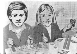
Musical instruments make music more fun!

11. LEARNING TO SIMPLY CLAP IN TIME TO MUSIC CAN BE PRACTISED AS A GAME & IS VERY ENJOYABLE FOR YOUNG CHILDREN. Always try to make every teaching effort fun & enjoyable, striving meanwhile to do things in a disciplined way & take time to work on areas that perhaps need more practise or drill than others. Our kids like to sit all together in a circle on the floor & clap their hands to the song they're hearing on tape or that we're singing, then clap their elbows, clap their knees, clap their feet, pat their tummies, pat the floor, pat their shoulders etc., to the beat of the music. This is especially helpful for very young ones like Tech!, who will always imitate so beautifully everything else the older children do. (This is, too, why your older children should be taught very well, as Dad has pointed out, for the younger ones will always imitate the older ones & older ones will always be quite responsible for teaching the younger ones!) (See "Copycats!")