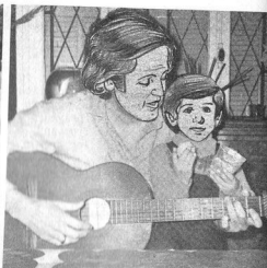
Play "David's Mighty Men"--one more time, please!