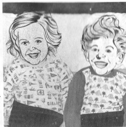
"One little sister keeps me busy enough! What am I going to do with two??"