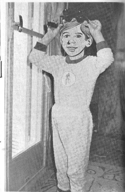
Daddy also gave me his real "spy-glasses" with binocular lenses!