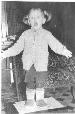
Stand up, Stand up for Jesus!