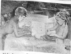
Kids form an Old Testament clay lamp with self-hardening clay. Wick soaked in olive oil to really burn!

tivities or crafts to emphasize your learning theme, but better still, simple & time-saving activities that will not drag out & perhaps never see completion, & ones that the children can even work on in their own freetime while you do other projects or work, as all us mommies do everyday! Oftentimes our learning period is in the morning, & our Bible activity project the children can usually complete on their own after their rest time in the afternoon, & while I'm busy with other projects but can keep fair supervision of their work. (To be continued! WJL)