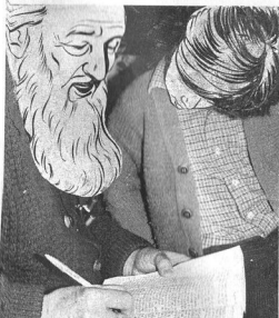
Dad marks "7" over "weeks" in his Daniel Chapter 9 Bible study!