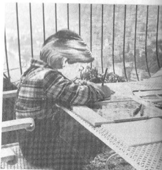
Schoolltime outside in the fresh air & sunshine!