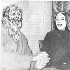
Dad & Mama sing a beautiful duet "In the Garden".