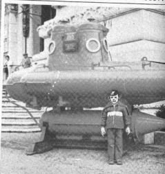
On excursion to the Museum of Exploration