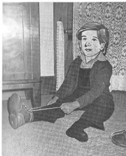
"Don't help me! I want to do it myself! Now, the fourth try..."