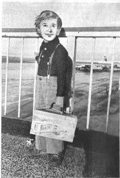
"Fleeing!!--On flight to Sicily!