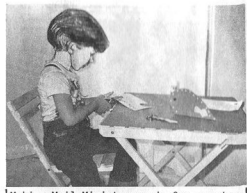
Making Mail Ministry cards for our dear Family who write us! WLY!