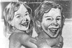
A twosome in the tub!

Scripture to his own daily life & activities, then he himself can judge whether the thing is right or wrong & will usually not get into any kind of trouble, for he has learned to be spirit-led of himself. But when he has been specifically warned not to do something, but goes ahead in acts of defiance, stubbornness & rebelliousness, he knows he deserves that spanking & takes it pretty well, even though he may sometimes pout in self-pity or pride for awhile. We simply discuss it then, explain to him why it should have been done that way, & continue on in the victory with prayer. PTL!