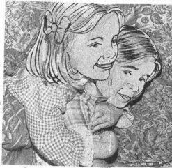
..But I wish it weren't so embarrassing!