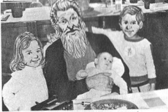
The children of the King!

31. WE'LL BE SHARING MORE ON THE SUBJECT of how "our now three kids" get along together, their activities & experiences, etc., but for now we can sum it all up by saying they're beautifully compatible & all three in love! We're so thankful for them & all the Lord has taught us through them!