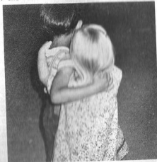
Young Lovers!--June '79

33. BUT JUST AS YOU FAMILY TOO WOULD AGREE , that we all benefit (having the Letters), from the personal & spiritual, Godly training, love & special care for all of us children, from the BEST parents in the World: Amen!