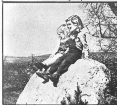
"I'm on the Rock, hallelujah!"