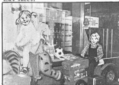
At the toyshop.

9. ACTUALLY, SEVERAL PEOPLE HAVE COMMENTED THAT DAVIDA REALLY ISN'T AS NAUGHTY AS I PUT ON , it's just that compared to sweet, obedient little David she seems to be a more "normal child". Dad suggested we include a few of our little David's shenanigans in this story too, just to show in comparison to David's exceptional case the progress & activities of a "normal child" to encourage others. Isn't that sweet?