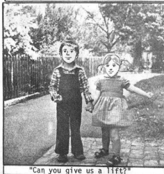
"Can you give us a lift?"