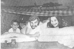
Brave gypsy pioneers in a basement tent.

11. CHRISTMAS '77: A COUPLE OF WEEKS BEFORE CHRISTMAS, THE WHOLE FAMILY ENJOYED WORKING TOGETHER