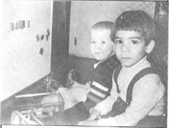
Magnetic letters adhere to fridge door.