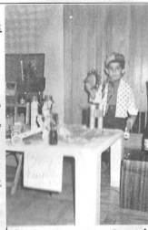
I'm also the gypsy orchestra!

12. REGARDLESS OF HOW MANY TIMES DAD MENTIONED HE HOPED WE'D ONLY HAVE A SIMPLE FAMILY CHRISTMAS TOGETHER & that perhaps the only gifts needed would be 1 for each of the 5 children in our home, they discovered our Christmas tree loaded with gifts late Christmas Eve night & left the following note on our kitchen bulletin board: