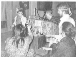
Selling his own crafts projects to family buyers.