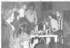
For you, my friend, a special gypsy price!