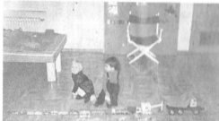
Toys on parade--shows cork bulletin board & model landscape also in the play area.

songs, then to the "Don Quixote" & "Gospel Gypsy Pirates" songs on the Children's Tape. Everybody put on paper hats during the song, "Gospel Gypsy Pirates" & played along with our instruments--bells, drumsticks, finger cymbals, & harmonica.