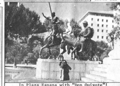
In Plaza Espana with "Don Quixote"!

The Lord sometimes just tests our faith. 4. AFTER DESPERATE PRAYER, IT TOOK A COUPLE OF WEEKS FOR HIS COMPLETE DELIVERANCE, which was