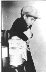
Tips make pocket change!

ALPHABET. As I bring an object to the table, he chooses out the letters which make the sounds to build up the word, such as "p-e-e-n, h-a-t". He still takes great interest in cutting out & pasting pictures in his own books & my writing a story for him to read.