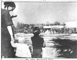
At the Madrid Zoo.