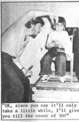
"Ok, since you say it'll only take a little while, I'll give you till the count of 30!"

8. FOR INSTANCE, WHEN HE MENTIONS THAT HE'D LIKE TO VISIT MOMMY & DADDY, WE RIGHT AWAY