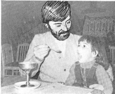
There are benefits to befriend-ing waiters!