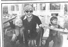
Boat-rowing. (2 yrs., 10 mos.)