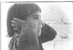
Jumbo jet landing! (3 yrs. 3 mos.)