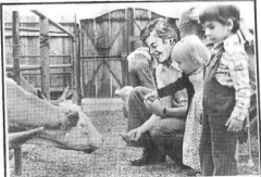
Feeding time at the zoo.