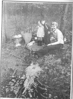
"All beef" wiener roast!