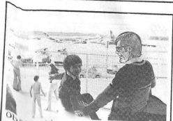
Observation deck of the airport--geography review of all the countries' airlines!