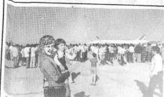
The Concord jet landing at the airport. (2 yrs., 8 mos.)