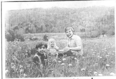
Picnic in the dandelions!