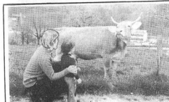
Visit to a local dairy farm.