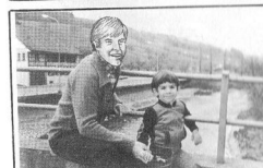
Nature walk in God's countryside. (3 yrs., 3 mos.)