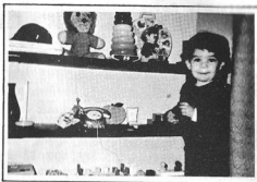
Art by Samson Warner; Typed by Abigail Warner

37. WE HAVE PUT HIS TOYS ON A WOODEN SET OF THREE SHELVES IN