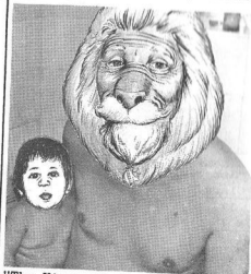
"The King and the Li'l Prince-- On the Throne!"--6 months.