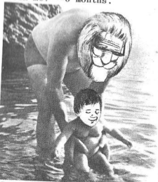
"Swimming with Daddy!"--6½ mos.