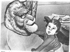
"Daddy even sets aside his breakfast and his work to play with me!"--6 months.