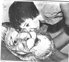
"I help keep Daddy happy!" --5½ months.