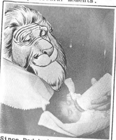
Since Dad had the most experience...--2 weeks.