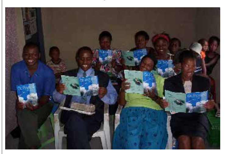
Happy Activated study group, South Africa

We recently visited him and shared with him about the Endtime, asking him if he ever included the subject in any of his sermons. He said, "Yes! I've been bringing the Countdown to Armageddon video to my prison ministry, and they really like it!" He then remarked that after a showing of the video the sisters all tore