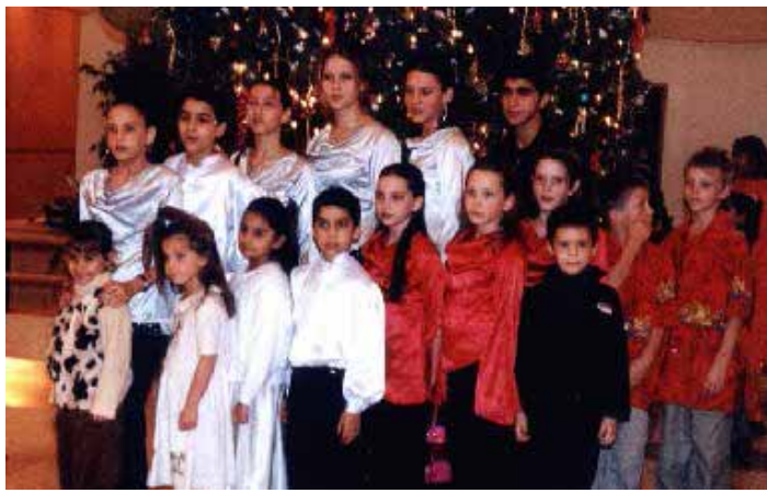
Yearly Christmas function at the Marriott: Islamabad singing team