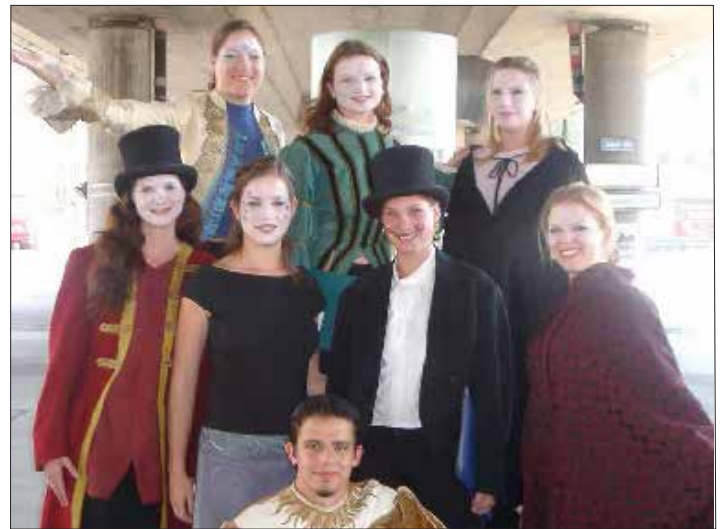
The team dressed up and ready to go, Zurich

part, such as in my style of dress, to be willing to be all things to all men that I might win them. It also took forsaking a lot of my thoughts or ideas that weren't really very on track. But I know now that the Lord never takes something away without giving something better in return, and for me, it was exactly what I had prayed for.