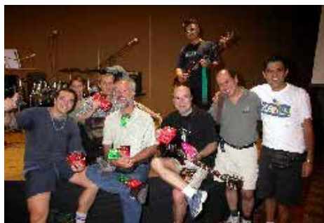
Our dear musicians and teachers