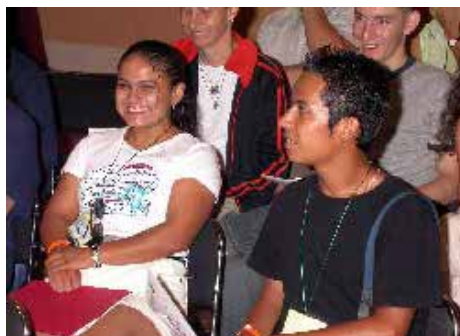
A couple of our sheep

a little over two months to get the ball rolling and everything organized. We wouldn't recommend it, but in spite of the shortness of time, the Lord did it.