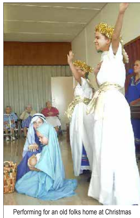
Performing for an old folks home at Christmas

seen this to be true firsthand. Try it; it could be the lifesaver for your kids that you have been praying for.