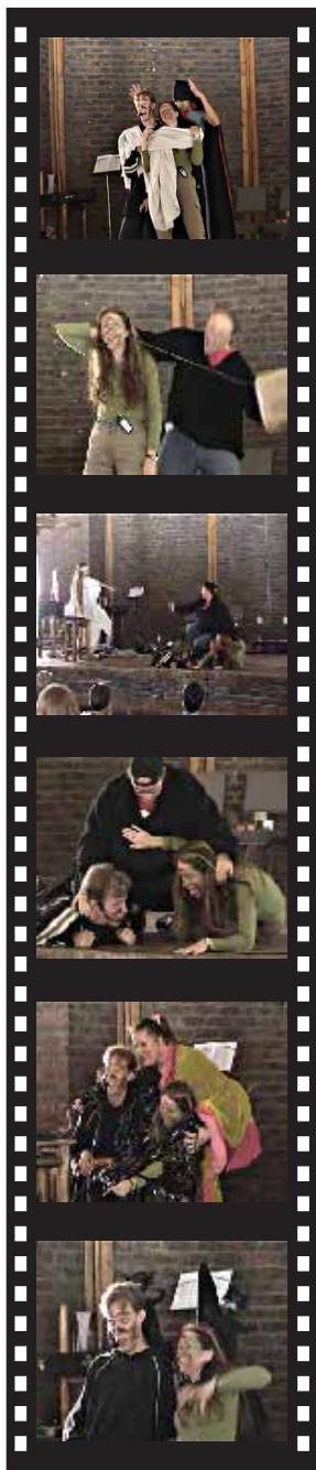
Skits performed about: Lethargy, Pan, Apotheon, Baccus, and the Selvegion

Our Word times consisted of topics such as the power of the keys, time is short, Endtime prep, redeeming the time, promises in the Word for our JTs, commitment, giving Jesus a chance, and more. We also had a commitment ceremony. We each took