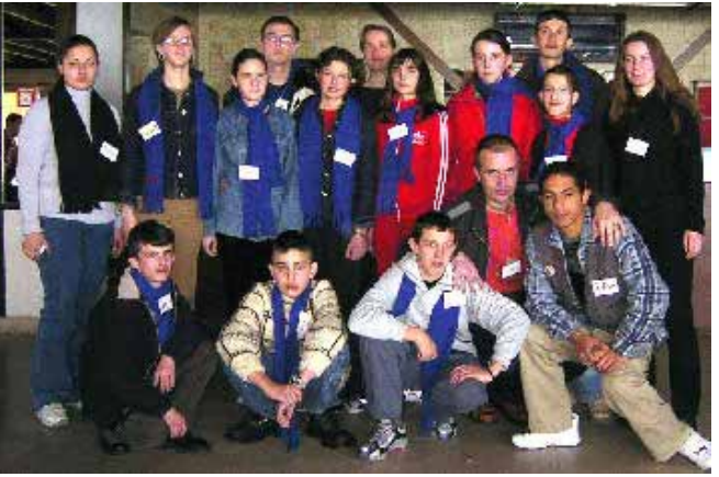
One of the groups from the multi-ethnic ski camp

A big miracle is that we received a grant that we had requested over 10 months ago that would supply us with funds to upgrade our sound system for our school show. The red tape surrounding this grant request was monumental, but the Lord did it for us! So now we have a brand-new setup that includes power speakers, a mixing board, and microphones. We were also able to get a new plug-in guitar, a generator (for when the electricity cuts, which is quite often), and a digital video camera. We give the Lord all the glory for helping this to come through, as it was certainly nothing of ourselves!