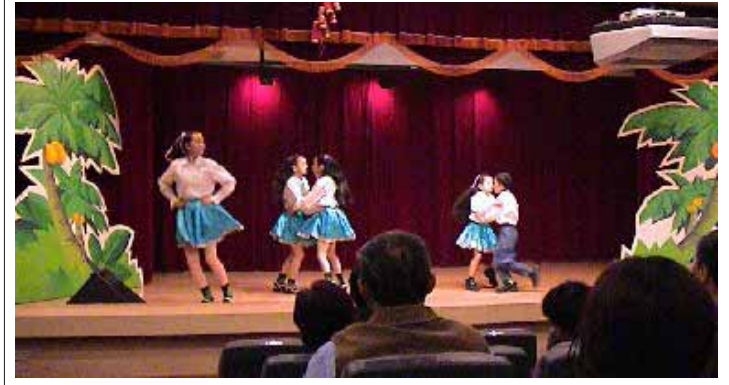
Our show for the health department