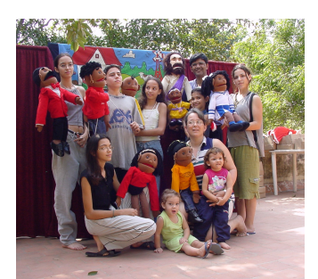
Our whole team with a set of puppets

We have been able to use them during Christmas, and did 22 puppet shows at orphanages, hospitals, cancer children, children with AIDS, for the elderly, school children, at Christmas parties, hotels, and shops. Everyone has commented how captivating the show is. All the teens, JETTs, and older OCs in the Home are involved in the show. They plan, practice, and