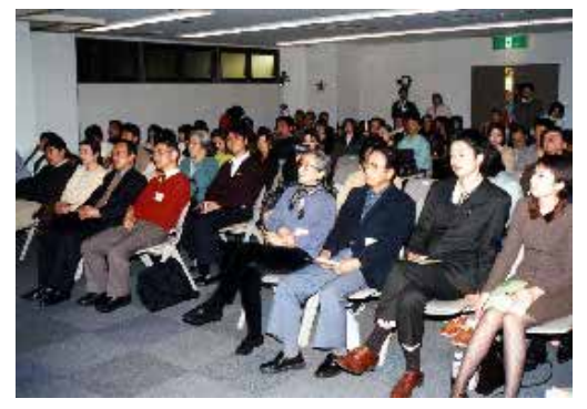
Audience at party

We held this event on a Sunday afternoon, so guests could bring their mates and children, and to make it easier for older folks who came from far way in the cold weather. Some visitors were crying while listening to our music, and all enjoyed the show.