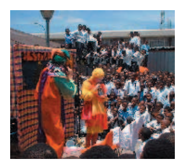
Christmas clown show in Soweto

Soweto during this time of uncertainty and fear.