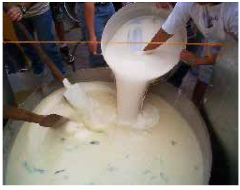
Pouring the maza into the big pot for the tamales