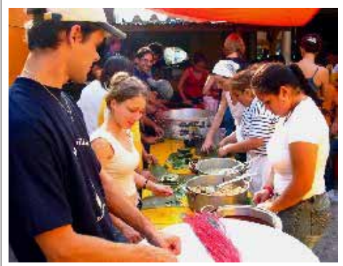
A happy crew making tamales! We worked for 10 hours straight that day on the tamales.

The next thing we knew, we were attending the meeting for the "Association of Restaurants in Boca del Rio" (ARBR). After explaining to them our need, they told us, "We'll take care of it, but you need to find the pots." Great news ... but what do we do about the pots?! So we went back to the vice-admiral. Amazingly enough, he happened to be good friends with the mayor of Alvarado, a nearby city that holds the Guinness World Record for the largest rice dish ever made. They were happy to lend us their pots and the navy was kind enough to transport the pots for us. We knew with these cooks and famous pots, the meal was sure to be a success.