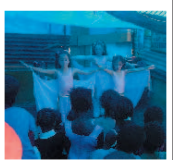
Children performing at our Christmas barbeque