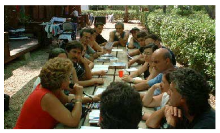
Spain: PR/Media board meeting

Lastly, we want to thank all of the cooks, provisioners, and all of those who helped make these fellowships possible.