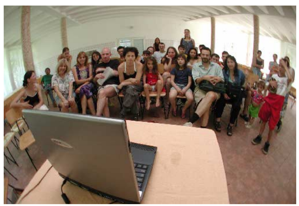
SOME OF THE ATTENDANTS WATCHING THE LATEST VIDEO VINE!