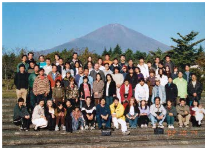
GROUP SHOT AT THE BOTTOM OF MOUNT FUJI, LOCATION OF THE MEETING

The meeting went very well. Many Family members commented that it was the best Active members' meeting ever. We are hearing many testimonies of lives changed from the Active members and their Homes. It's only the beginning! The Lord said, "I will perform mighty miracles through you. I will reap a great harvest in this land through your faithfulness."