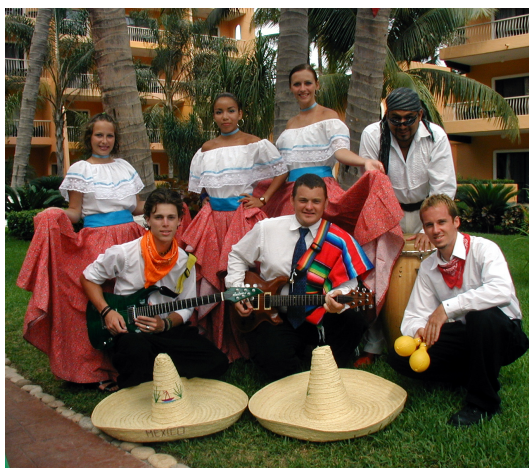
Some sets are acoustic, going from table to table at the seaside La Cucina restaurant. There were beautiful witnessing opportunities on every side.