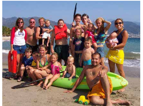
La Familia—all together! We had a wonderful time with our kids at the beach and in the swimming pools. The kids were shiner witnesses.