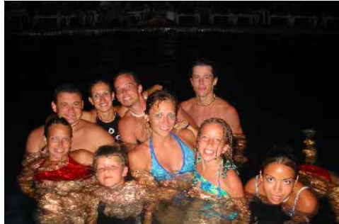
Our little family together in the pool by the beach at night