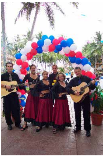
Before an acoustic evening performance on the terrace overlooking the beach