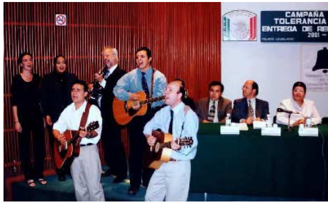
Band singing at the Mexican congress during religious tolerance event

t his is just a very brief synopsis of what's been happening lately. More people are on their way or writing for clearance! There's plenty of room in Mexico for bold and brave missionaries that would like to come. There are a number of potential cities in Mexico that have no Homes, so if you're interested please get in touch with SACRO. (Write to: sasgp@attglobal.net)