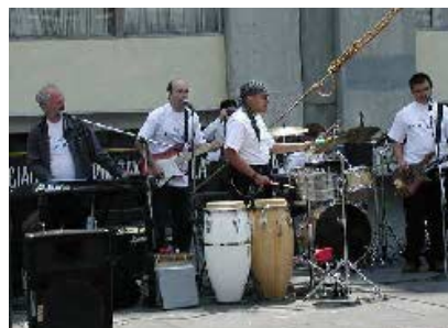
Band playing in the "plaza of the three cultures" during a religious tolerance event