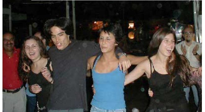
Family young people burning free!

of our Sunday fellowships out of town in Homes that have big green areas or in city parks where we can enjoy a little cookout and put on a Holy Ghost sample. We've also had out of the ordinary movie nights with special features like the new Jesus movie or the Omega Code .