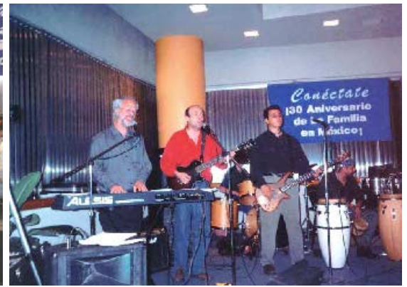
Band at Activated meeting