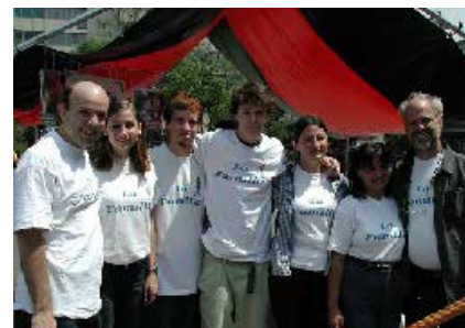
The team at the plaza