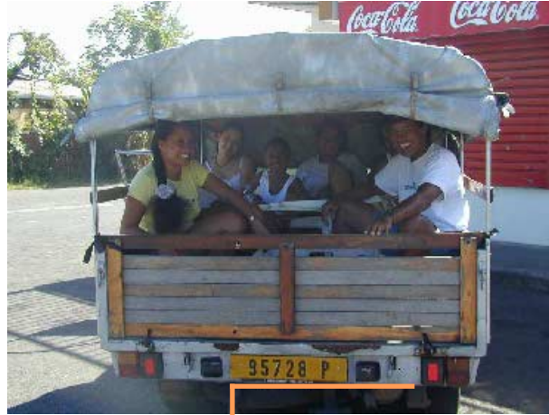
Taking public transportation