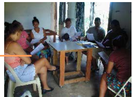
Weekly Bible study group