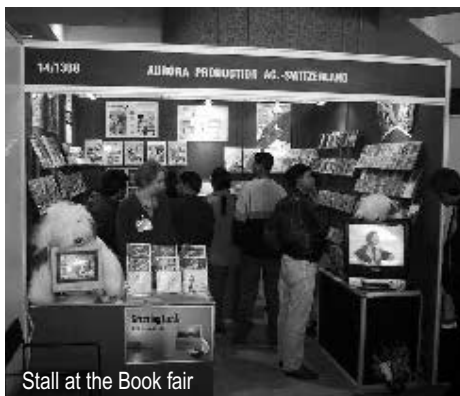
Stall at the Book fair