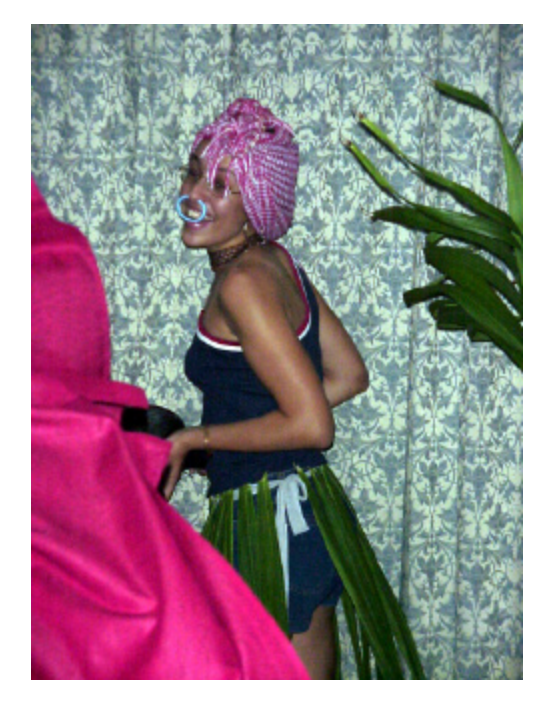
African dress-up night

My prayer is that, at the end of the day, should I in fact be asked, "Who are you?" I will, by His grace and power, be