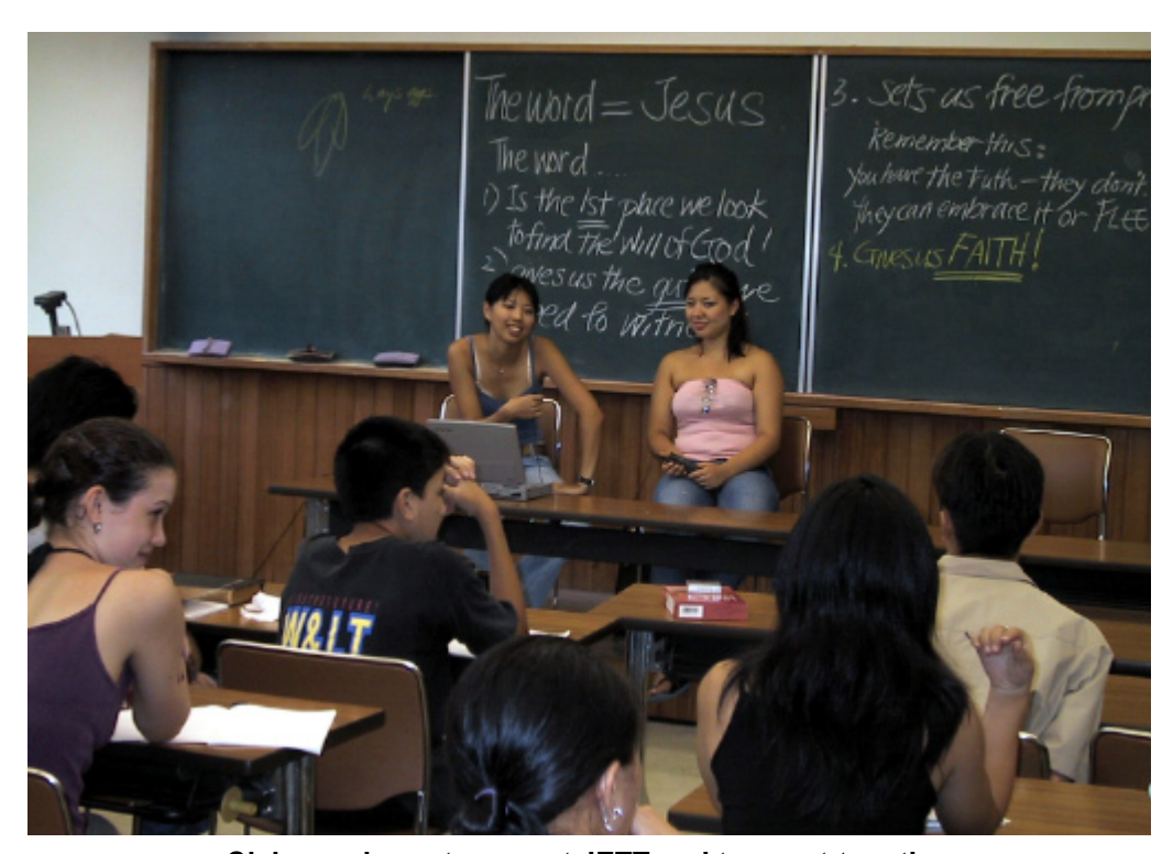
Giving a class at a recent JETT and teen get-together

The Lord gave me a new start. He is help-